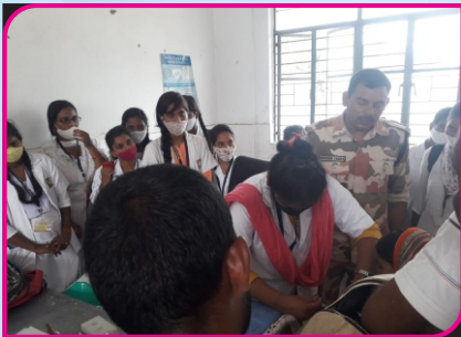
Govt. Hospital Training