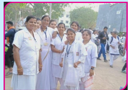
Community Health Nursing Training