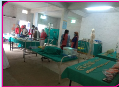
Nursing Foundation Lab