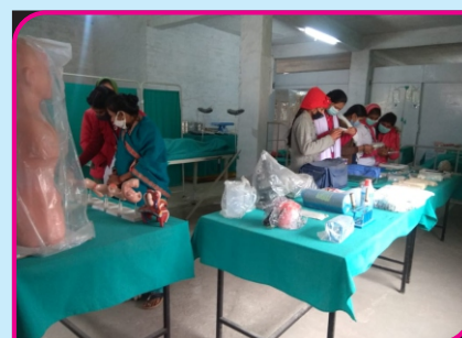
Nursing Foundation Lab