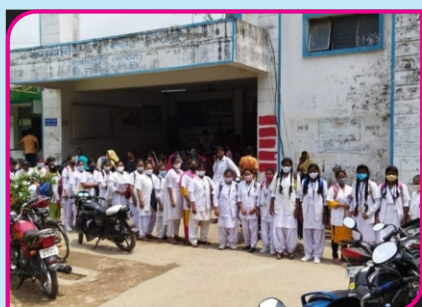
PHC, Jalalpur (Saran)