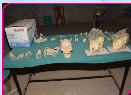
Nursing Foundation Lab