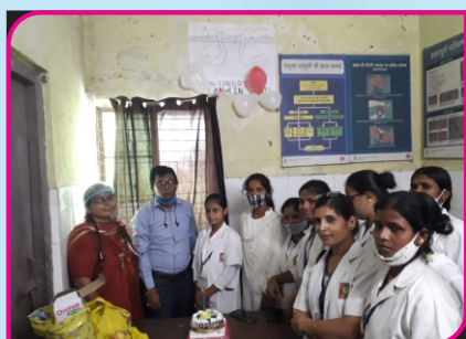
PHC, Nagra (Saran)