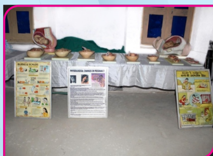
Nursing Foundation Lab